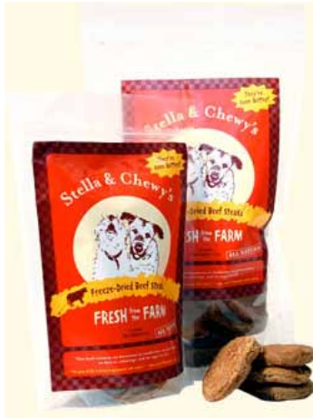
Stella & Chewy's Freeze Dried Food Steaks 20% Off