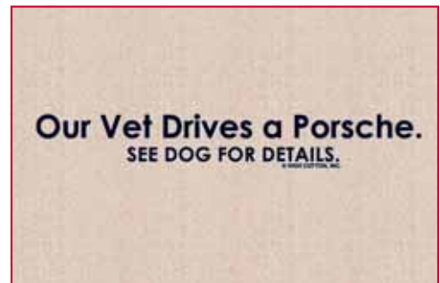
Humorous Doormats 20% Off