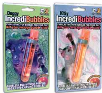
Specially formulated Long lasting IncrediBubbles 20% Off