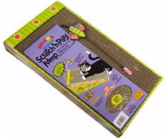
Kitty Hoots Scratch'n Play Ramp 20% Off